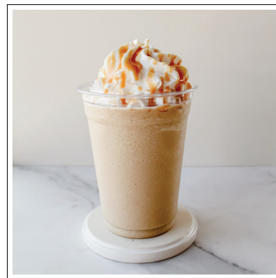
Salted Caramel Cinnamon Roll Latte Salted caramel & cinnamon roll