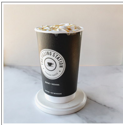
Tres Leche Latte Dulce de leche & sweetened condensed milk