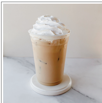
Maple Cream Cold Brew Maple spice & cream