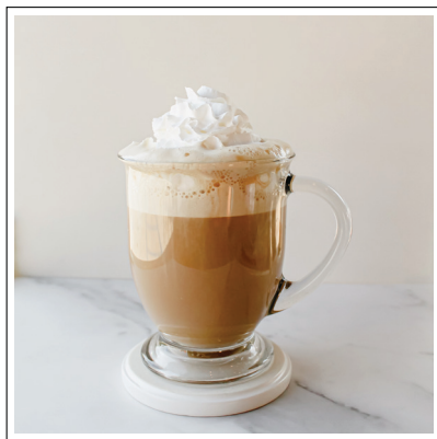
Maple Vanilla Latte Maple spice & vanilla

All drinks can be ordered hot, iced, or blended.