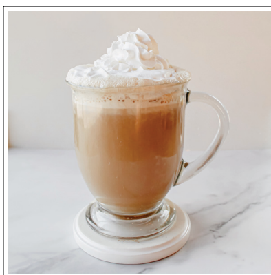
Maple Brown Sugar Latte Maple spice & brown sugar