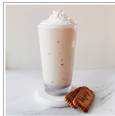
Cookie Butter Milkshake Cookie butter spread topped with whip & spiced cookies