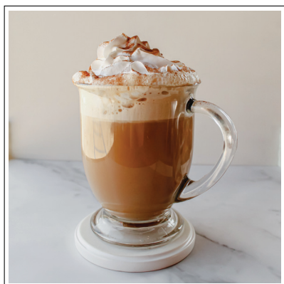
Pumpkin Spice Latte Pumpkin spice topped with whip & cinnamon