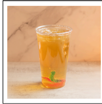
Cider Smash Lotus Gold Lotus, apple, cranberry, & cinnamon bun. Topped with gummy.