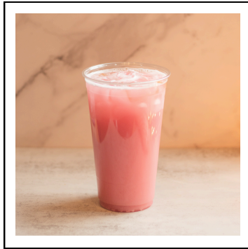
Pumped Up Pomegranate Lotus Pomegranate, coconut, pink Lotus, & cream. Topped with gummy.