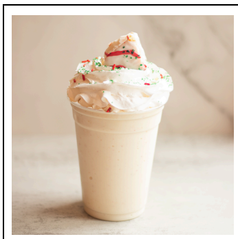
Christmas Tree Milkshake Vanilla ice cream & Little Debbie Christmas tree. Topped with whip & sprinkles.