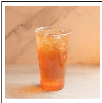
Santa Spritzer Lotus Gold Lotus, strawberry, & cranberry. Topped with gummy.