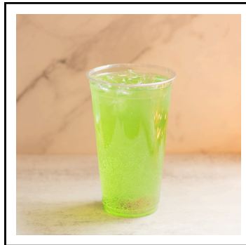
The Grinch Lotus White Lotus, green apple, kiwi, & pineapple. Topped with gummy.