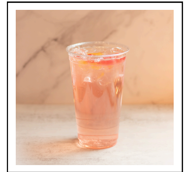
Rudolph Lotus Pink Lotus, cranberry, & peppermint. Topped with gummy.